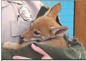
LA Animal Services Wildlife Division

Coyotes in captivity and in the wild may generally live to be 14 years old, however urban coyotes rarely live to ages beyond 2 or 3 years as a result of being hit by cars, killed by large dogs, disease and parasite affliction, rodent poison ingestion, and extreme weather events.